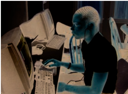
Online HACC coursework being completed at the Joshua House Resource Center.