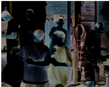
JCrew enjoying a summer barbeque!